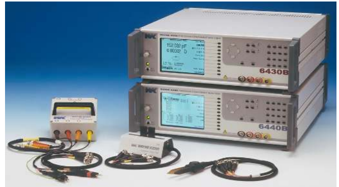
Accurate component analysis to 500 kHz (6430B) or 3 MHz (6440B) is simplified by many accessories which includes Overload Protection Unit 1J1100

The protection unit will protect the test equipment from up to 25 Joules of charged energy.